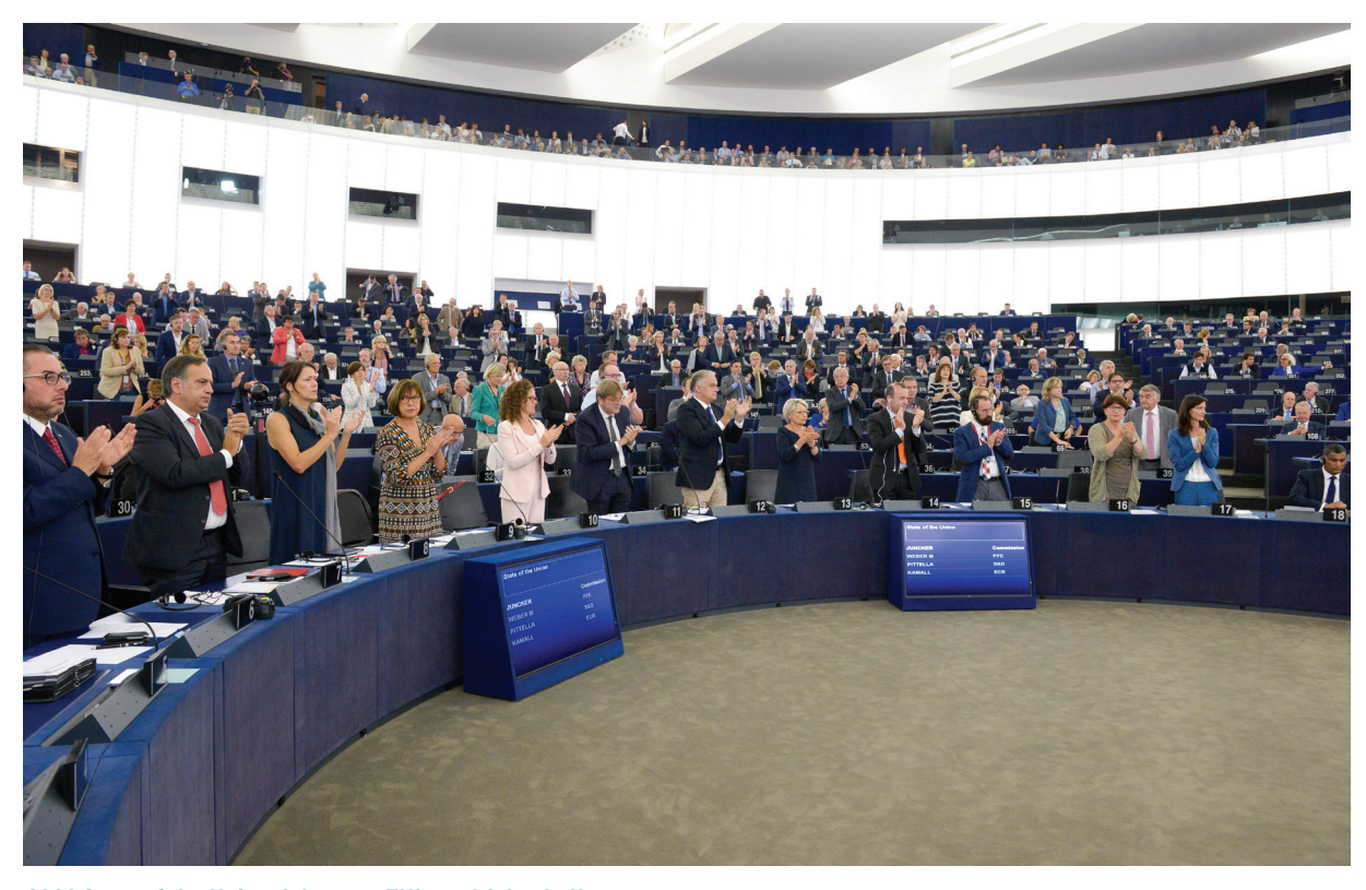
2016 State of the Union debate on EU's multiple challenges

With the growing clout of illiberal, nationalist parties in several EU Member States, the space for compromise is shrinking at EU level. This is due to such parties already being in government, as is the case in Hungary and Poland; mainstream parties being under siege, as was the case in France and the Netherlands,; and EU institutions being cautious not to expose governments or themselves to political attacks. As a consequence, international climate policy and EU leadership are on the ropes.