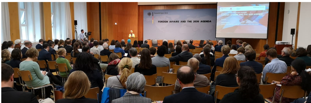
Launch event at the German Federal Foreign Office in Berlin, 30 April 2019

She stressed how science needs to be used as a guide towards SDG implementation, which is currently not the case in the African context. “Much of the SDG implementation is basically not connecting to science,” said Denton, pointing out Africa’s limited research output as a problem (it only accounts for less than 1% of global research output).