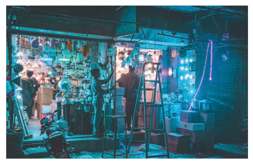
Fragile contexts consistently rank in the bottom third of the 157 countries for which data on SDG progress is available.

which are also fragile - in fact, over half of the 58 contexts on the OECD's 2018 Fragility Framework are middle-income - supports the notion that there is more to fragility than economic growth and poverty,3 as has the rising incidence of middle-income countries experiencing conflict. Moreover, many countries have considerable variation of fragility within their borders,