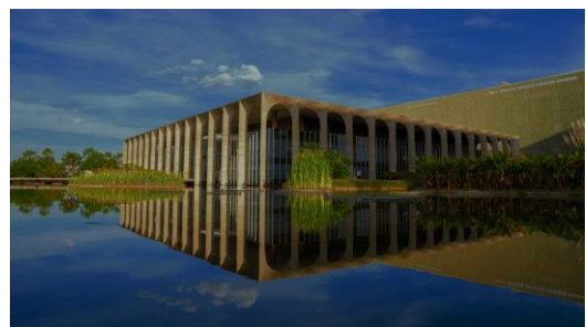
Palácio Itamaraty – Headquarters of the Ministry of Foreign Affairs of Brazil

Current discussions around climate and environmental risks to human security often look at nations as either contributing the most to climate change (higher income countries) or being affected the most by its impacts (lower income countries). Brazil challenges this notion through its combination of large-scale industries and widespread inequality and human insecurity. This demonstrates that there is a need for these discussions on the international level to be inclusive of such complex socioeconomic dynamics, as they present unique entry-points for action. For Brazil, this translates into a combination of need for international support, however with increased implementation capacities.